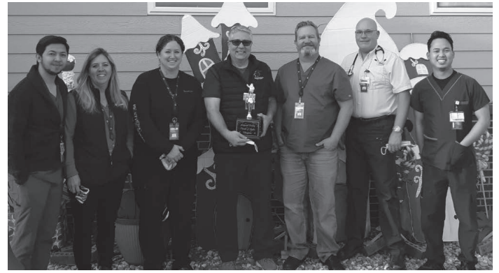
▲ 2021 Sedgwick County Parade of Lights Winners: Sedgwick County Health Center

Over the years, each parade has grown with more participants, spectators and events to draw the community together. Each community comes up with their own activities and events for the evening, including serving chili and hot chocolate, hayrack rides