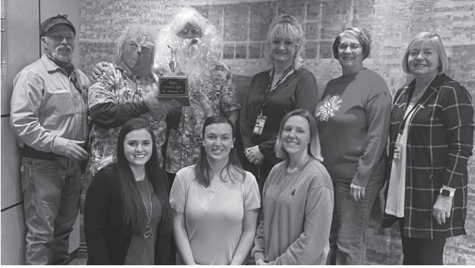
▲ 2021 Holyoke Parade of Lights Winners: Melissa Memorial Hospital Foundation Board.

As of this year, the Parade of Lights has been running in Holyoke for 24 years and Sedgwick County for seven years. Highline Electric Association and CHS Grainland are proud to co-sponsor this year's parades again, along with both of the local chambers of commerce.