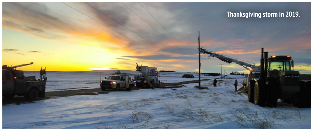
Thanksgiving storm in 2019.