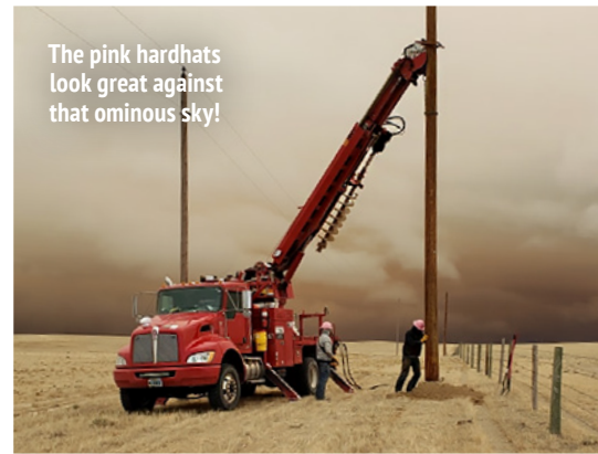
The pink hardhats look great against that ominous sky!