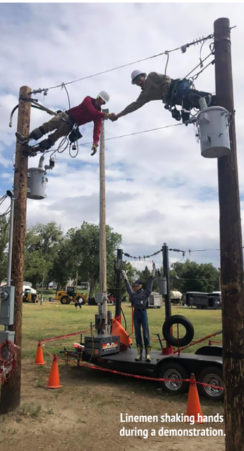
Linemen shaking hands during a demonstration.