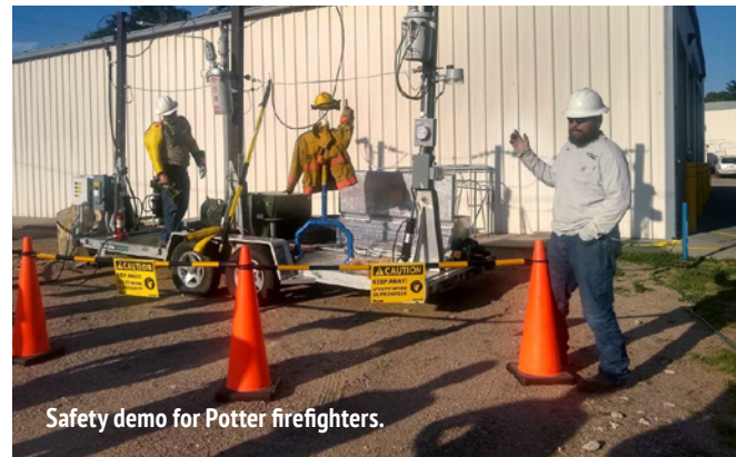
Safety demo for Potter firefighters.