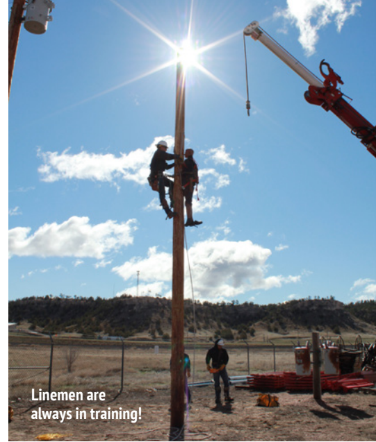
Linemen are always in training!