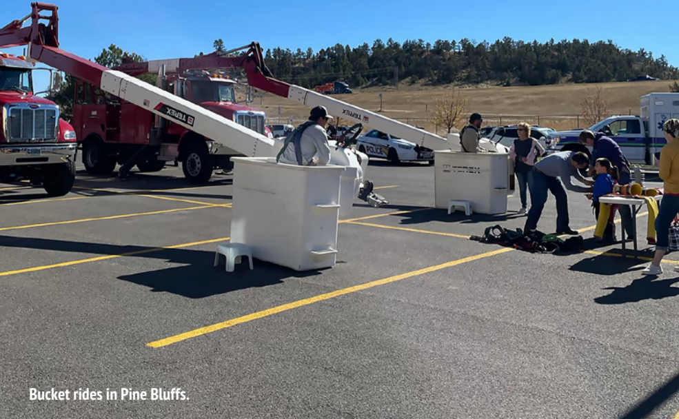
Bucket rides in Pine Bluffs.