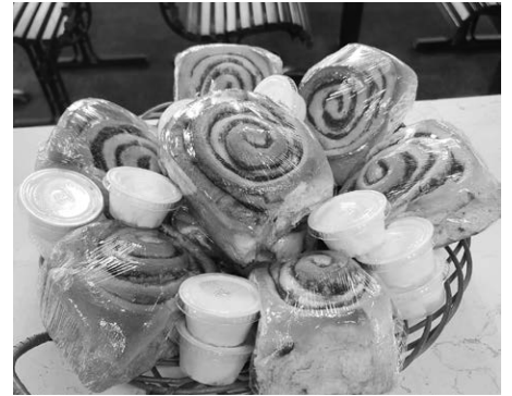
Lucy's Place cinnamon rolls.

For those looking to indulge in something special, Lucy's Place offers all-day specials throughout the week, including Sunday