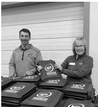
▲ HEA employees hand out reusable grocery bags to members.