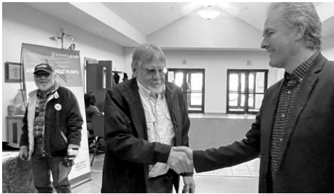
▲ The HEA Annual Meeting brings together neighbors and friends from across the service territory.