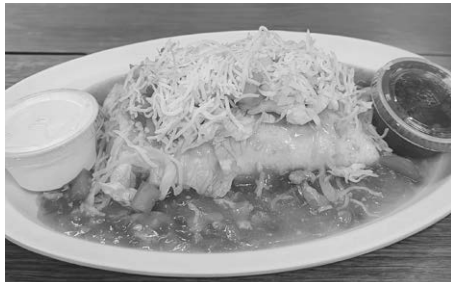
Lucy's Place green chile is a great addition to a burrito.

As you wind your way along the South Platte River Valley, Lucy's Place awaits atop a hill, offering not only a respite for the weary traveler but also a feast for the senses. The scenic views overlook the valley and create a serene backdrop for a dining experience that transports you back to a simpler time.