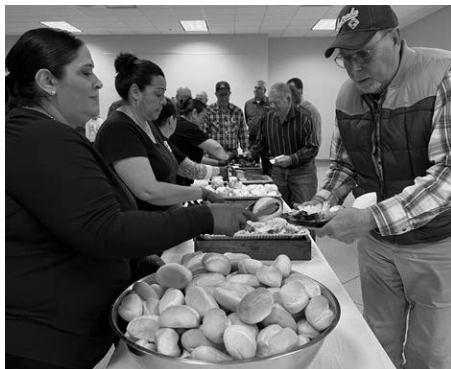
▲ At the annual meeting, members enjoy dinner catered by locally-owned Happy Jack's restaurant.