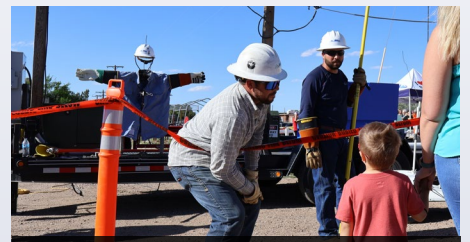
MVEA's High-Voltage Demonstration taught guests of all ages about the importance of electrical safety.