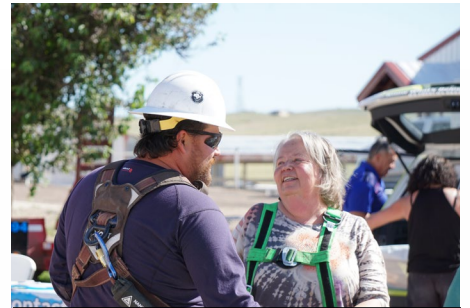
Over 600 guests joined MVEA for its 83rd Annual Meeting of Members. The bucket truck ride was a crowd favorite!