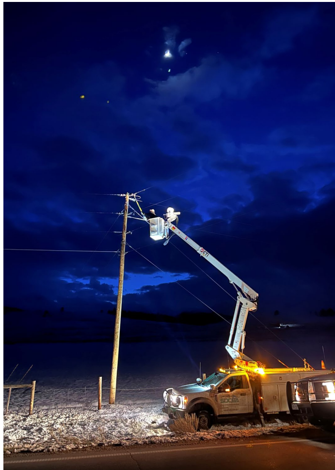
^ Lincrews work under a bright moon as skies clear from the May storm in Lake County.