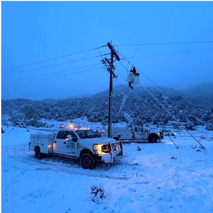
^ Crews work safely and diligently to restore power to multiple areas without electricity in storm-battered Custer and Fremont counties.