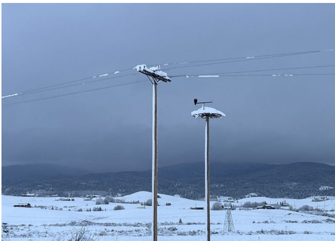
^ An osprey surveys the work from its SDCEA-constructed perch along Hayden Meadows.