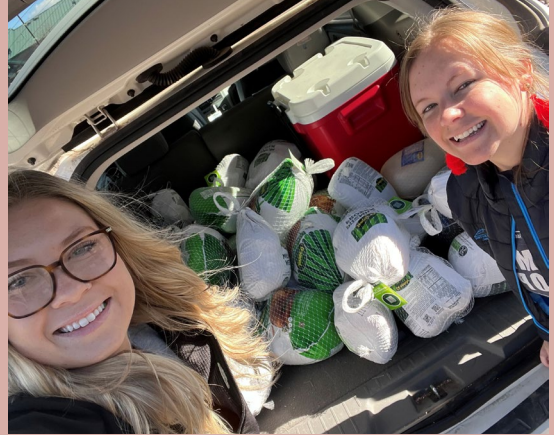
Through the generosity of MVEA members and employees, the co-op donated 36 turkeys to Fresh Start in 2023. The goal is to at least double the donation this holiday season!

While Operation Round Up runs year-round, November is an especially fitting time to highlight the power of community giving. It's easy to join the thousands of MVEA members already enrolled in Operation Round Up. With just a few clicks, you can opt-in to round up your electric bill on SmartHub, helping your community without any extra effort. For more information about Operation Round Up, visit www.mvea.coop/round-up .