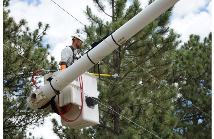
Jason Covak, a member of MVEA’s tree trimming crew, assesses a tree that is growing too close to power lines in Black Forest. According to Jason, a busy day might see the crew filling two full truck bins, which equates to about 18,000 pounds of debris.

Sam Dahlstrom, another skilled MVEA tree trimmer, highlights the importance of considering tree health when trimming. He stresses that proper trimming and pruning techniques are crucial to