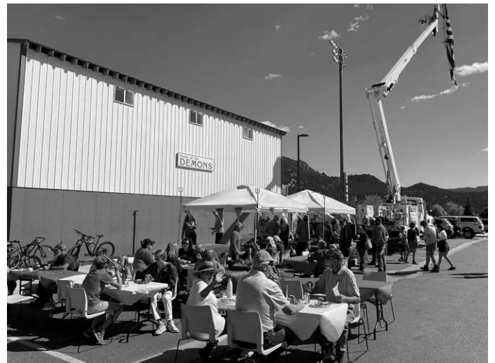
SDCEA hosts a tailgate party at the BVHS homecoming football game. Scanga Meat Co. hamburgers and hot dogs, drinks, chips, and cookies are enjoyed by the crowd of community members.

For more information about SDCEA and upcoming events, check these pages, our website, and follow us on Facebook and Instagram.