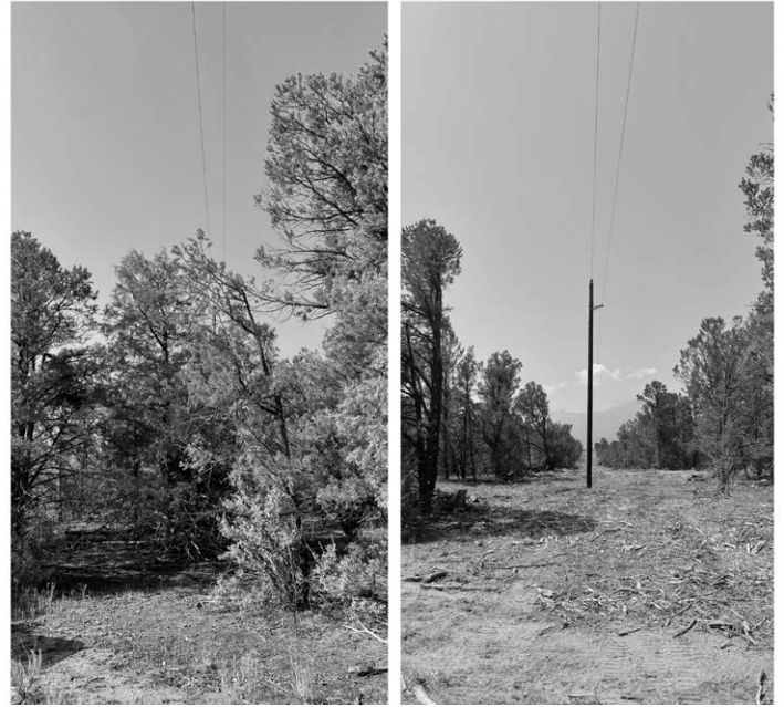
▲ Vegetation management work (before and after) conducted earlier this year.

For any questions or concerns, please do not hesitate to reach out to us. Email us at info@myelectric.coop or call toll-free at 844-395-2412.