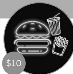
Fast-Food Combo Lunch