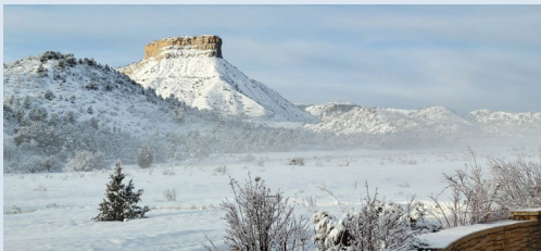
Mesa Verde Park Point in Winter.

January 20 – Martin Luther King, Jr. Day