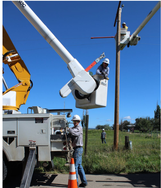
EEA Linemen Matt Ruggles, Shad Bellmire, Brett Crouse, and Chase Suckla work on the three phase upgrade to Weber Canyon serving members south of Mancos, Colorado. This project is part of EEA's construction work plan to increase capacity where we see consistent growth.

EEA will continue to keep safety and reliability as top priorities. If we continue to take advantage of cost saving opportunities that do not jeopardize safety or reliability, then affordability will be a natural result. There is upward rate pressure on the horizon. Inflation has abated but has not been eliminated, and our long-range work plan indicates we will need to replace equipment and add capacity to two substations in the next five years. Our financial forecast indicates we can meet our financial policy requirements as well as those of lenders without an increase in base rates until 2028. I cannot guarantee we will not have a rate increase until 2028 because no one can predict the future. What I can promise you is that we will continue to manage the things we can control and abide by the cooperative principles that define our business model. Thank you for supporting EEA as we continue to meet your electrical energy needs in a safe, responsible, and reliable manner.