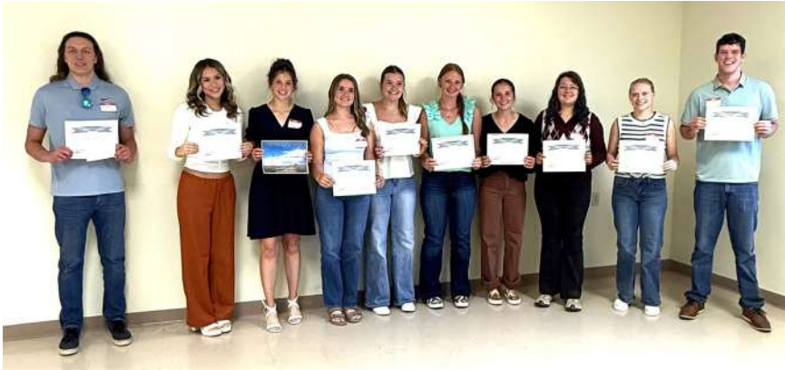
SECPA's 2026 scholarship recipients at the annual meeting in April.