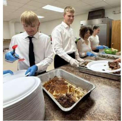
Thank you to Baca County 4-H members for serving the meal at the annual meeting.