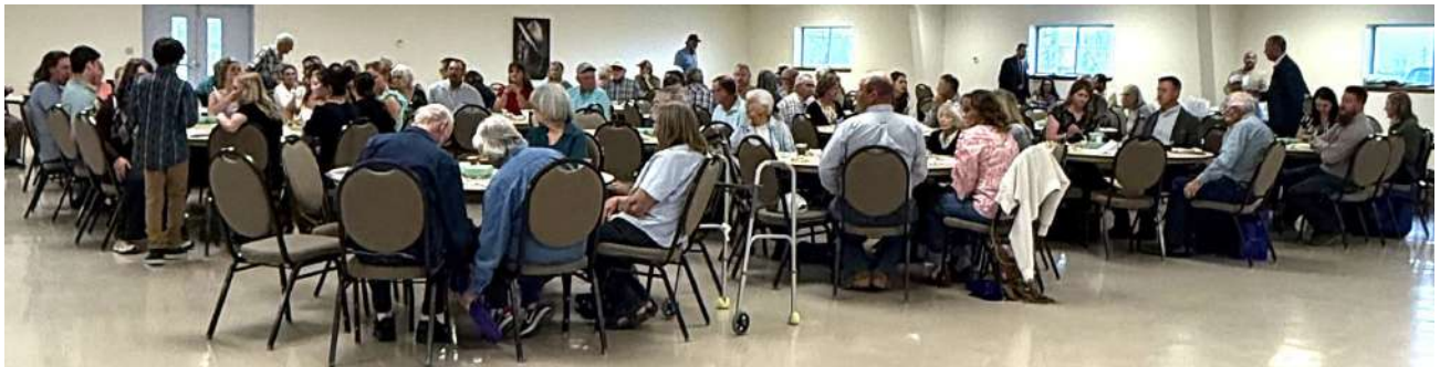
Members enjoy a meal and fellowship at the SECPA annual meeting.